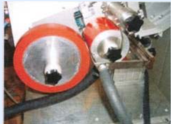
Rotary Print Head