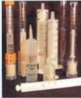
Syringes with 360° wrap around print