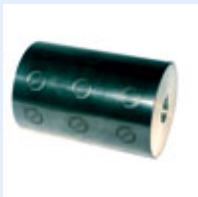
High-tech ceramic cliché cylinders