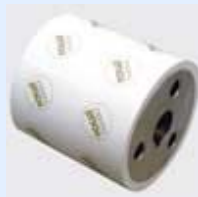
Ceramic cliché cylinders