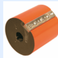
Magnet screen clamping cliché