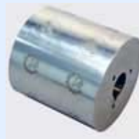
Steel cliché cylinder