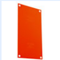
Magnet screen cliché