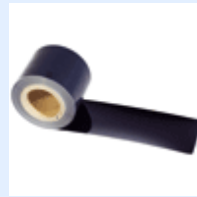
Cliché band microflex