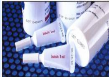
Outstanding Print Quality & Reliability