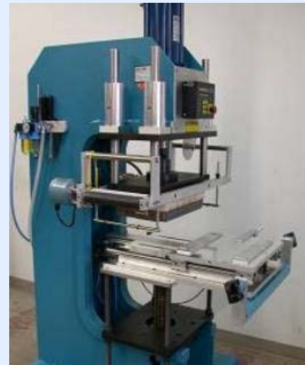
Hot Stamp machine for large parts with Linear Shuttle to slide parts in and out of the print head